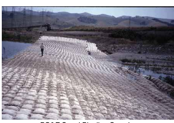
PG&E Sunol Pipeline Crossing

With the removal of Niles and Sunol Dams, the next major fish migration barrier upstream of the flood control channel is a cement armored PG&E gas pipeline crossing of Alameda Creek in the Sunol Valley. This crossing likely poses a barrier for upstream fish migration at most water flows. PG&E is working to identify potential alternatives for fish passage projects at this site and has pledged to make the crossing passable to fish.