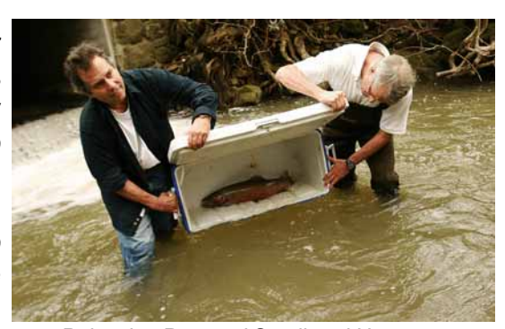
Releasing Rescued Steelhead Upstream

access to much more potential habitat than in previous years, including stream reaches in lower Stonybrook Creek, Alameda Creek in Niles Canyon, Alameda Creek in the lower Sunol Valley up to the PG&E gas pipeline crossing, lower Arroyo de la Laguna up to the Castlewood drop structure, Sinbad Creek in Sunol, and San Antonio Creek in the Sunol Valley below Turner Dam. We hope to get the permit for fish rescue and monitoring by the end of January.