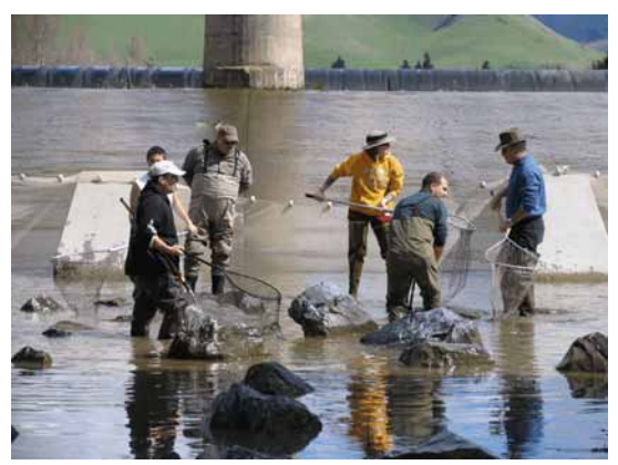
ACA Volunteers at BART Weir

The Alameda Creek Alliance, East Bay Regional Park District and Alameda County Flood Control District have put in a request to state and federal regulatory agencies for a permit to rescue steelhead trout blocked at the BART weir in lower Alameda Creek this winter. The proposal is to move rescued fish into lower Niles Canyon, radio tag and track the movements of all adult fish, and extensively monitor upstream reaches for any potential spawning activity.