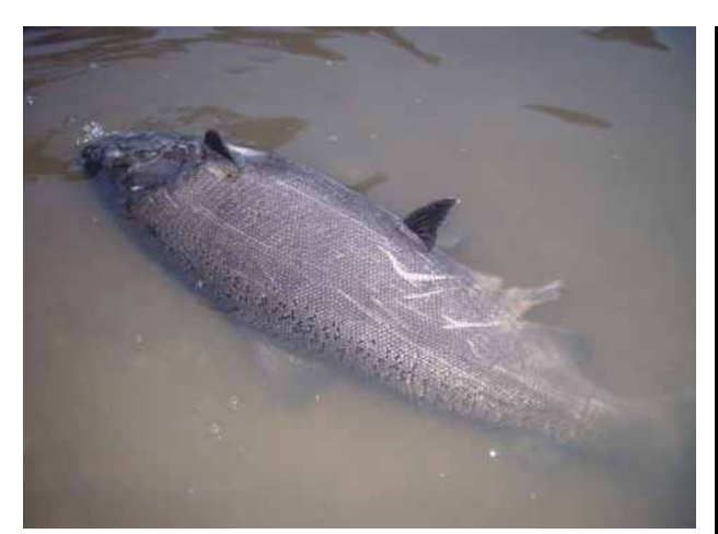
Dying chinook salmon at BART weir December 13

ALAMEDA CREEK ALLIANCE NEWSLETTER Issue 23 • Winter 2006-2007